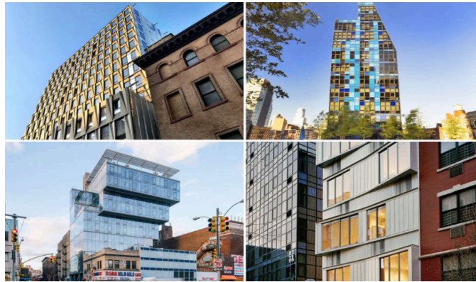
Lower East Side Condos with style

Widely known for its tenement buildings, the gritty and "real" Lower East Side might be trading those in for swanky new residential developments. And while that typically means a lot of cookie-cutter condos, the neighborhood has allowed (or forgiven) some cutting-edge designs to rise – even before the announcement of the massive Essex Crossing, which will alter the area forever with its 1,079 apartments, 400,000 square feet of offices, 450,000 square feet of retail, and so much more. From The Switch Building to ODA's newly-built 100 Norfolk, CityRealty ranks the Lower East Side's most striking past and in-progress condos.